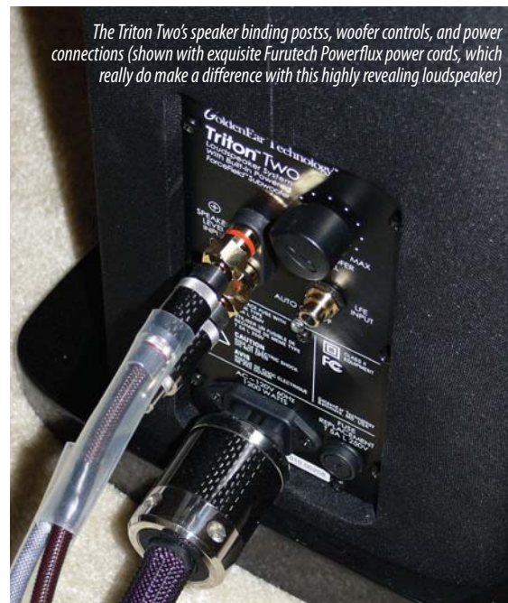
The Triton Two’s speaker binding postss, woofer controls, and power connections (shown with exquisite Furutech Powerflux power cords, which really do make a difference with this highly revealing loudspeaker)

I believe the GoldenEar Triton Two will in due time earn a reputation as a watershed product, largely because it places very high-level sound quality within reach for those of us who must operate within the often tight constraints of real-world, Everyman budgets. I also suspect the Triton Two will serve as a thrown gauntlet of sorts vis-à-vis any number of high-end poseurs, forcing them either to put up, shut up, or figure out a way to deliver greater performance per dollar. And from my point of view, that’s a wonderful thing.