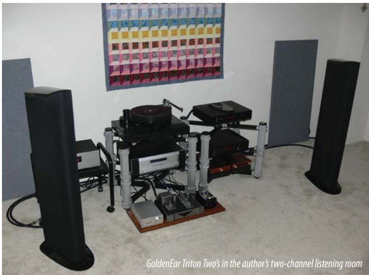
GoldenEar Triton Two's in the author's two-channel listening room

The Triton Two is a slim, 48"-tall tower type speaker that features five active and two passive drive units, and that includes what amounts to a full-on, built-in, self-powered (1200-watt) woofer/subwoofer system. Up top, the Triton Two sports a D'Appolito array comprising two 4.5-inch mid-bass drivers fitted with "multi-vented phase plugs" plus a small, rectangular Heil-type "high velocity folded ribbon" tweeter. Down below, in a separate chamber, there are two oblong long-throw 5-inch x 8-inch "quadratic" woofers, a pair of also oblong 7-inch x 10-inch "planar" passive radiators, and a built-in 1200-watt subwoofer amplifier, which uses DSP circuitry to ensure optimal matching between the upper range of the woofer section and the lower range of the D'Appolito array.