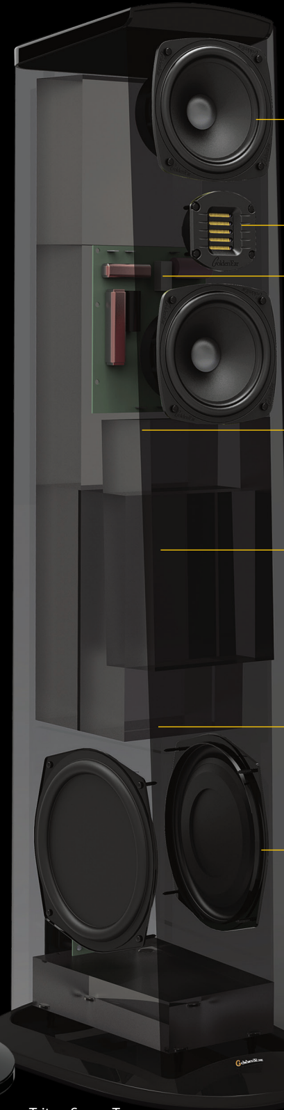
Triton Seven Tower

Accelerometer Optimized Non-Resonant Cabinet