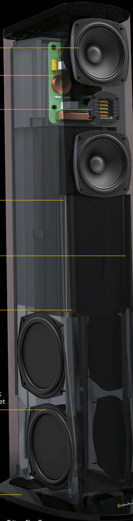
Triton Five Tower

Accelerometer Optimized Non-Resonant Cabinet