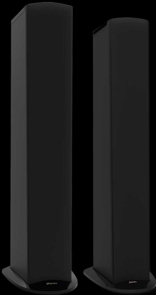
Triton Five Tower